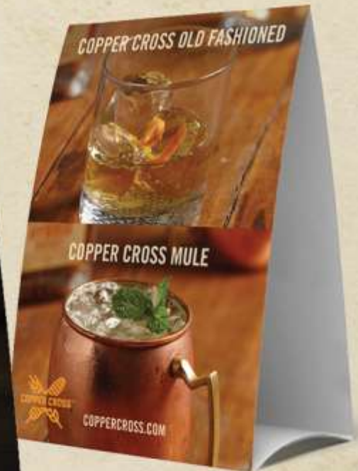
Table Tent (front and back)